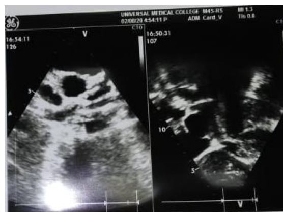
Figure 3: Echo - Echocardiogram shows normal structure and good ventricular function of heart