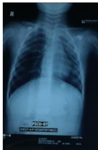
Figure 2: Chest Xray - Chest X-ray shows pulmonary infiltration in left lung